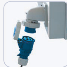
230V power supply (pluggable)