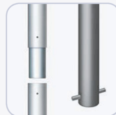
Two-part pole + ground sleeve