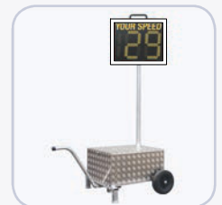
Mobile battery trolley