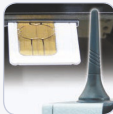
Data transfer by email + GPS