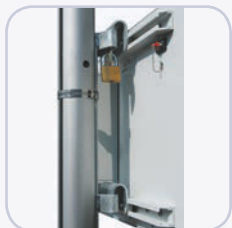
Lockable mounting kit (for poles \varnothing 40 - 160mm)