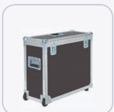
Flightcase (M-SID BASIC and BASIC-D)