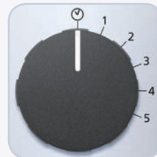
Manual parameter setting