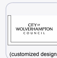
Additional text board (large)