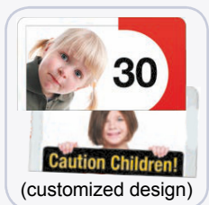
Fold-away front screen (M-SID MINI + M-SID TEXT)