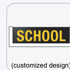
Additional text board (small)