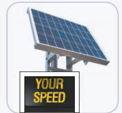
Solar power supply (50W)