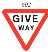
600mm: MOR2002R 750mm: MOR2002S