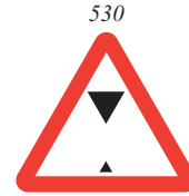
600mm: MOR2009R(*) 750mm: MOR2009S(*)

* INDICATE HEIGHT * (metric, imperial or both, please state)