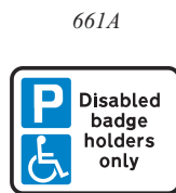
600 x 450: MOR2022J