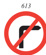
600mm: MOR2025R 750mm: MOR2025S