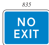
600 x 450: MOR2011J