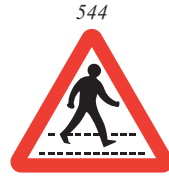
600mm: MOR2008R 750mm: MOR2008S