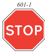
600mm: MOR2001R 750mm: MOR2001S