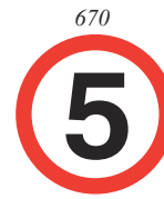
600mm: MOR2004R 750mm: MOR2004S