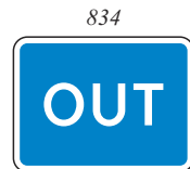
600 x 450: MOR2010J

* INDICATE HEIGHT * (metric, imperial or both, please state)