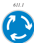
600mm: MOR2027R 750mm: MOR2027S