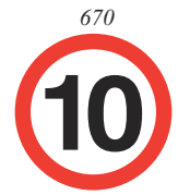
600mm: MOR2005R 750mm: MOR2005S