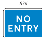
600 x 450: MOR2012J