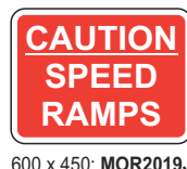
600 x 450: MOR2019J