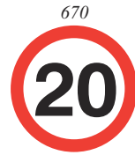
600mm: MOR2007R 750mm: MOR2007S