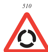
600mm: MOR2029R 750mm: MOR2029S