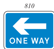
600 x 450: MOR2014J