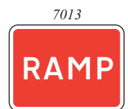
600 x 450: MOR2017J