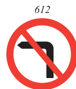
600mm: MOR2024R 750mm: MOR2024S