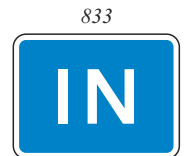
600 x 450: MOR2013J