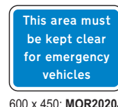
600 x 450: MOR2020J