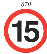
600mm: MOR2006R 750mm: MOR2006S