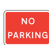
600 x 450: MOR2016J