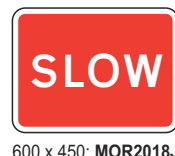
600 x 450: MOR2018J