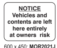
600 x 450: MOR2021J