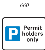
600 x 450: MOR2023J