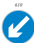
600mm: MOR2028R 750mm: MOR2028S