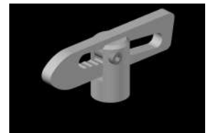
Anti-luce clips (stainless)

For more details please call our sales dept: