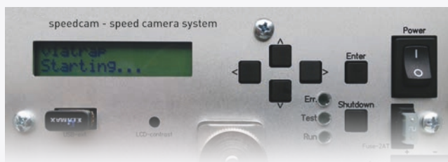
Control panel inside the battery box.

The image sequence shown above, illustrates how the speed violation on your premises can be identified and documented. The M-SID SPEEDCAM is not generally recording image data, only speeding cars, trucks or fork lifters are logged in the internal memory. The logged data set consists mainly of: a speed value, the location, a time stamp and images of the speeding vehicle.